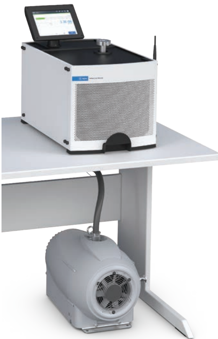
HLD BD15 bench leak detector with IDP-15 dry scroll pump connected.

Accessories: Agilent Power Probe sniffer (3, 7.6, 15, and 18 m lengths)